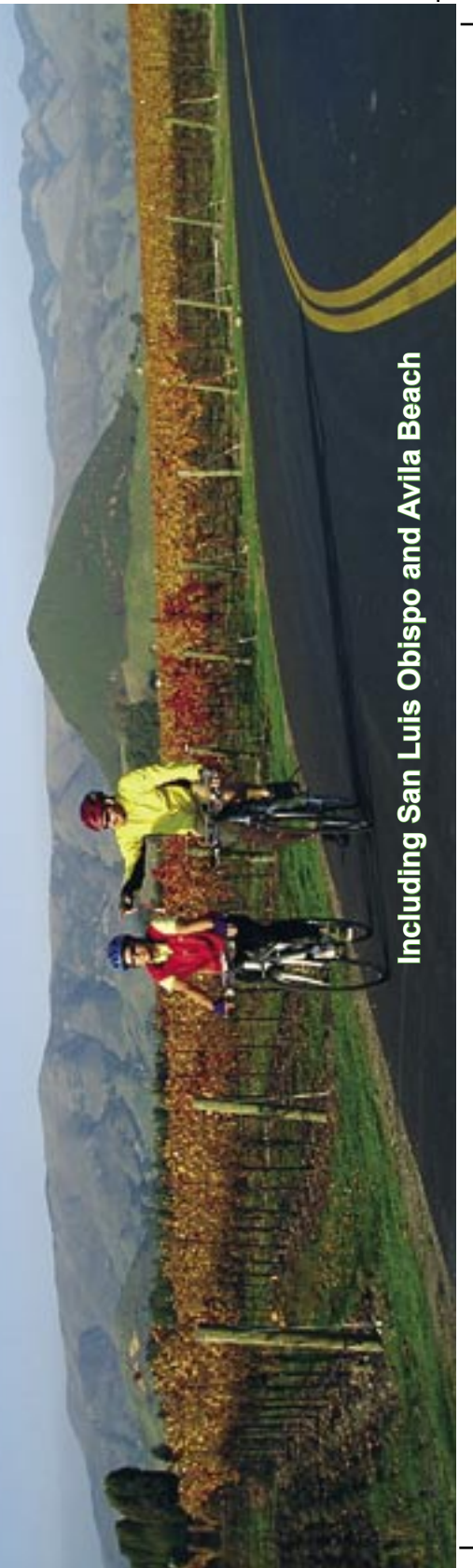
Including San Luis Obispo and Avila Beach